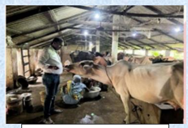
Our secretary giving food to the cows at our gaushala