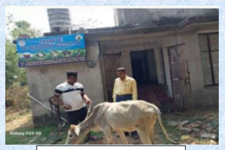
Animal regular health check up by Veterinary Doctor at our Hope Veterinary Hospital.