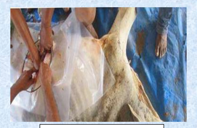
A cow receiving necessary surgery